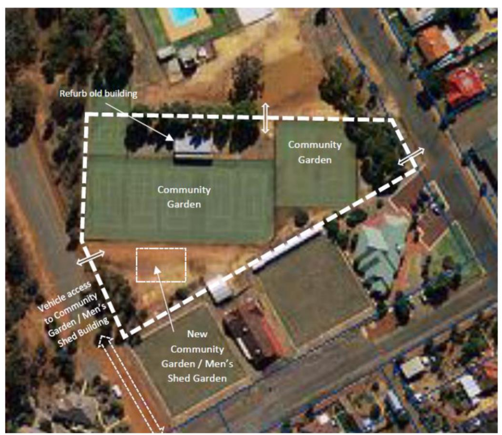
Figure 7 - Outline of Community Garden / Men's Shed Precinct

The Brookton Community Garden utilize the area of the old tennis courts on Reserve 43158, facing White Street Brookton. This use was planned in the Council's Brookton Reserve 43158 Management Plan – 2020 – 2030.