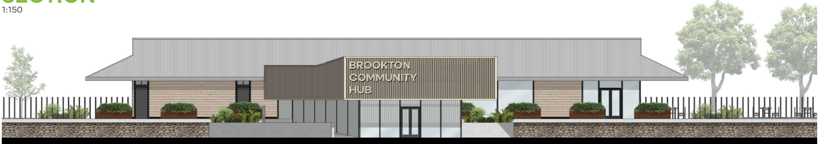
EAST ELEVATION 1:150