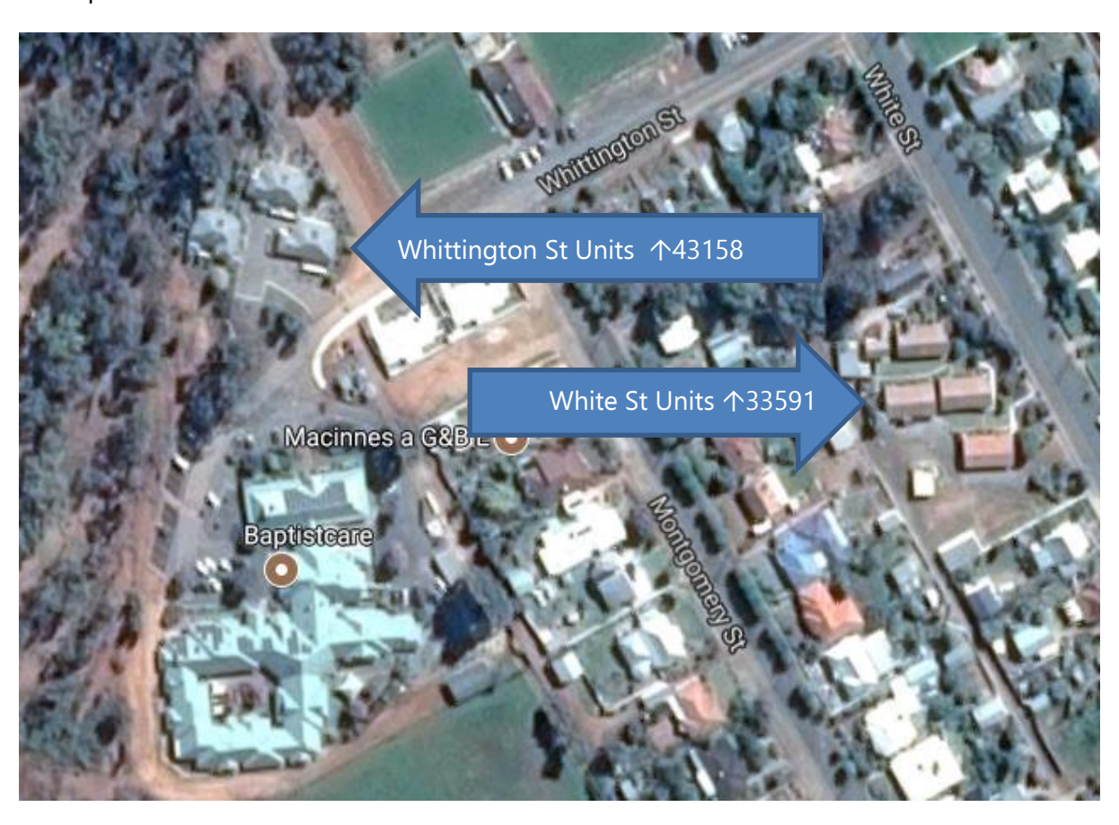
Figure 1: Location of Lot 456 White Street (on Whittington St) and Lot 420 White St

The aim of the review being to inform Council on the implications of future control, including ongoing management, current condition, and future maintenance / remedial works that may be required in the short to medium term.