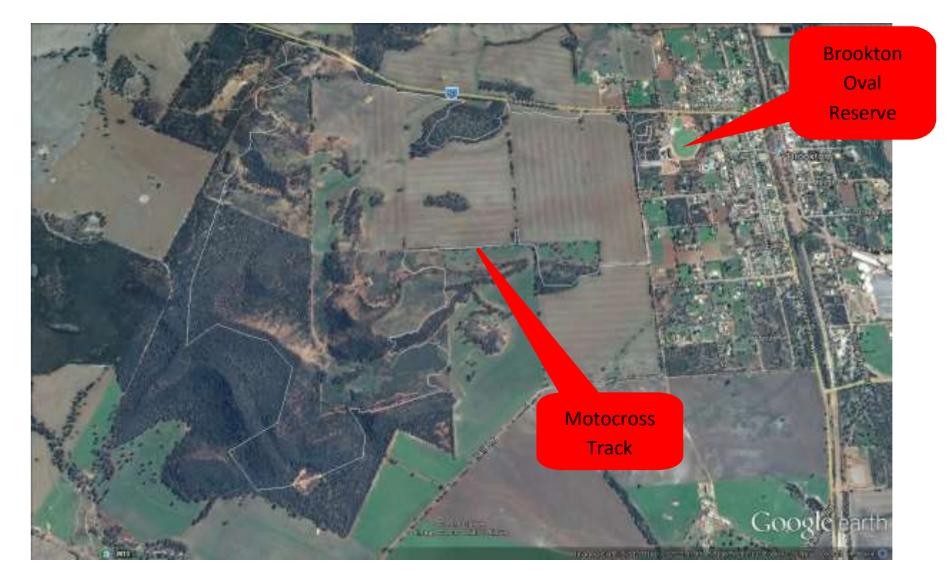
Figure 2 – Aerial Photo of Complete Track Layout