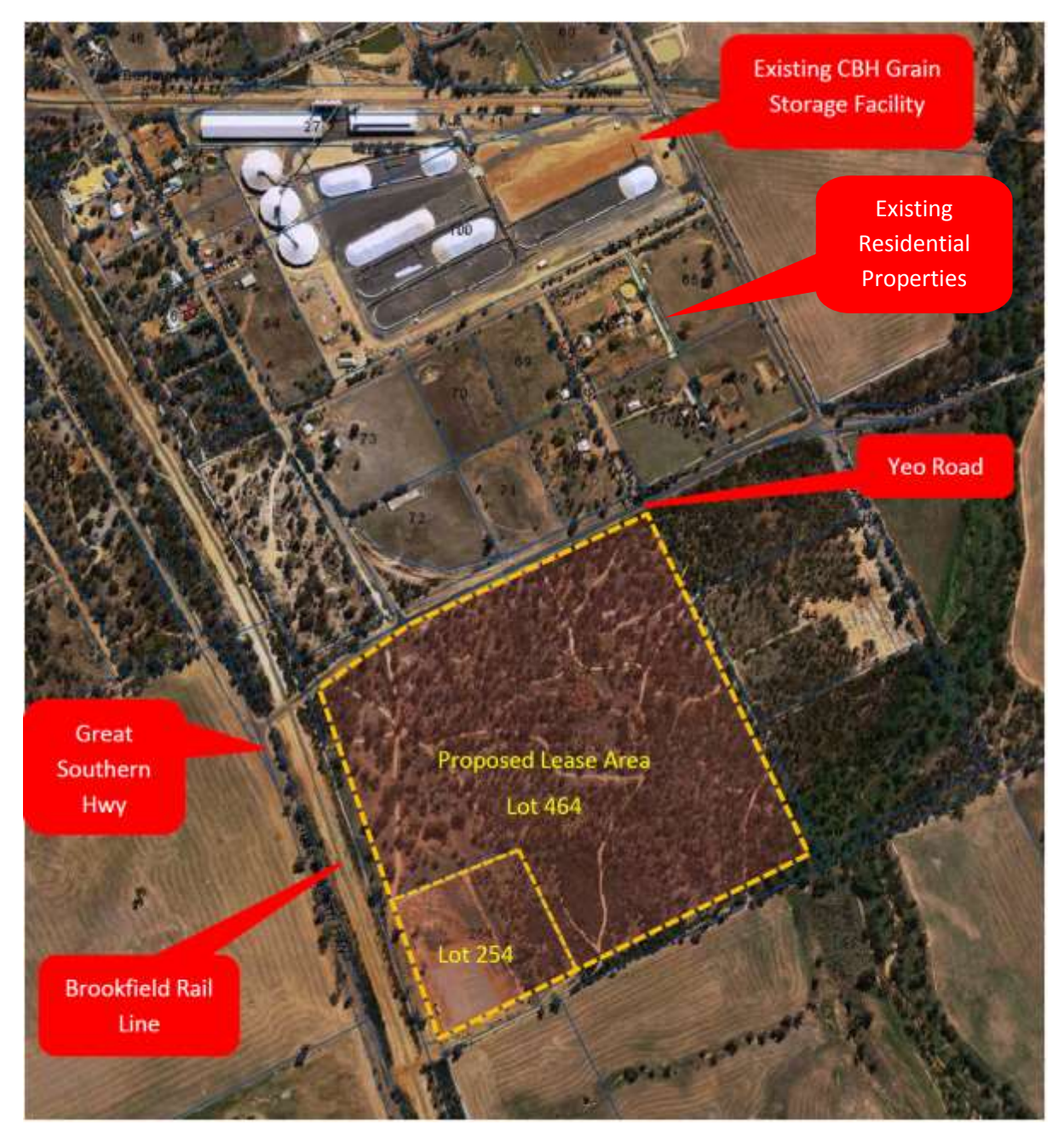
Figure 1 – Proposed Lease Area by CBH Group